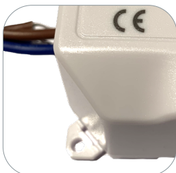
Fixing for surface mounting